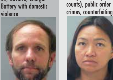
Houston Cir., Gulf Breeze, Charges: Drug possession, drug equipment possession